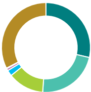
Asset allocation (%)