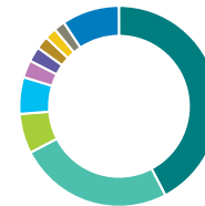
Sector allocation (%)