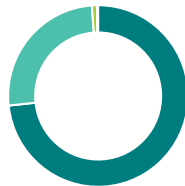
Geographic allocation (%)