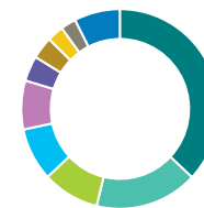
Sector allocation (%)