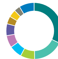
Sector allocation (%)