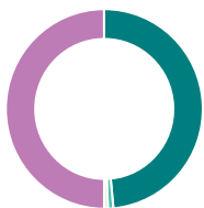
Asset allocation (%)