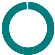
Asset allocation (%)