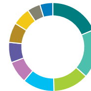
Sector allocation (%)