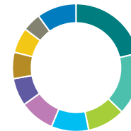
Sector allocation (%)