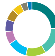
Sector allocation (%)