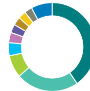
Sector allocation (%)